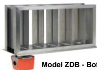
Model ZDB - Bottom Mount