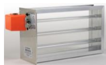
Model ZDS - Side Mount