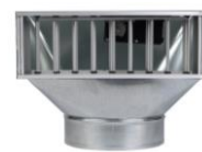
OZD inserted in Duct Boot

The NEW Outlet Zone Damper, Model OZD, is an aluminum opposed blade damper that inserts into the outlet or opening of the duct into a room. The damper with self-contained motor simply inserts into the outlet opening. The depth of the damper is 2.25" and the motor is towards the center of the damper and adds another 1" of depth that easily allows the OZD to fit into most angled floor boots. The OZD is then covered with any flat floor grille, those without dampers, or registers. The OZD is powered by ZONEFIRST's exclusive Plug-In Damper Motor. Each OZD includes 100' length of plenum rated cable, Model PRC1, for wiring run thru the duct. The PRC is also available in 200' lengths, Model PRC2, with modular connectors (RJ11) already for installation. Both prices listed below.