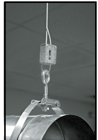
Spiral Buckle with eye bolt and the Dyna-Tite Wire Rope Suspension System