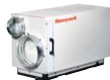
TrueDRY™ DH90 Whole-House Dehumidifier

Controls Humidification Terminals allow you to wire and control bypass, flow-through or steam humidifiers.