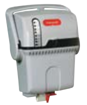
TrueSTEAM™ Humidification System

Three-Wire Communication Only three wires from the thermostat to the Equipment Interface Module make even retrofit installations quick and easy.